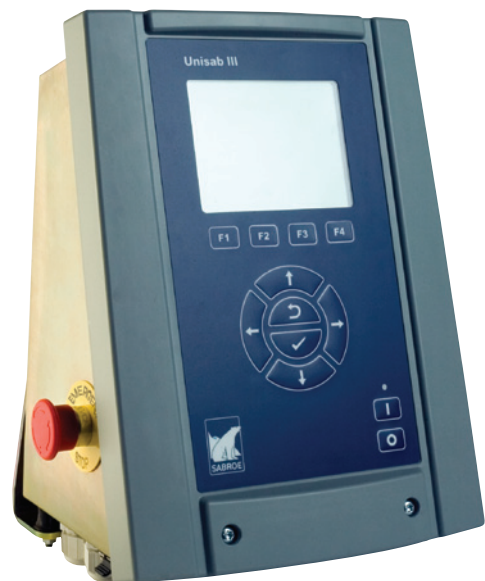
Unisab III systems controller